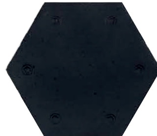
6 POINT BLACK AC 0402