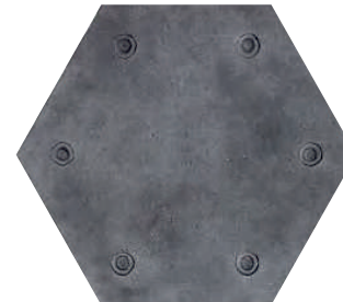
6 POINT FUME AC 0403