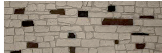
OVAL STONE WHITE AS 0302