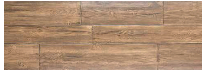
PARQUET WALL FUME AW 0402