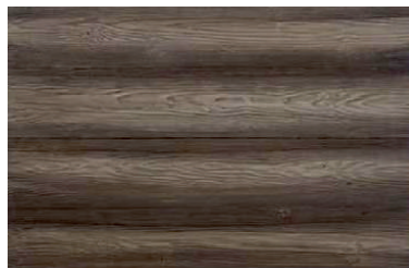
WEDGE FUME AW 0004