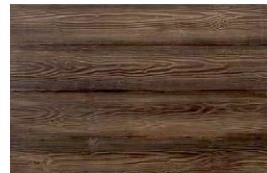
WEDGE FUME PATINA AW 0005