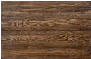
WEDGE WALNUT AW 0003